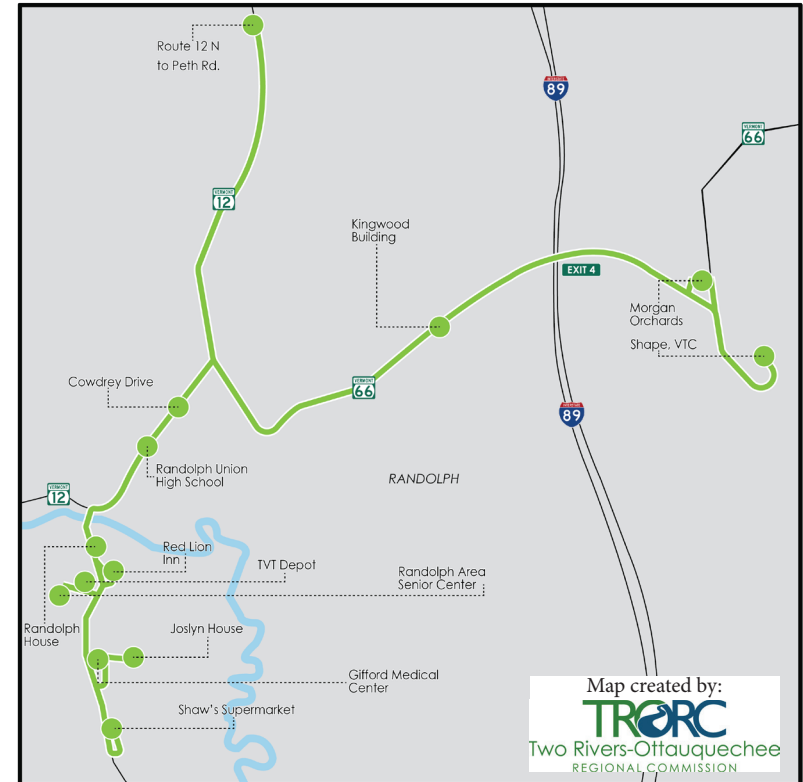
Green Route serves Randolph, Randolph Center & Bethel Extension - AM

TVT bus routes are FARE-FREE and OPEN TO EVERYONE!